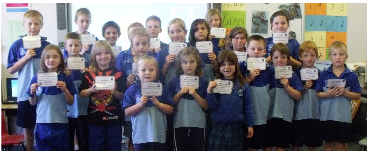
Students who represented the School in the Anzac Day March