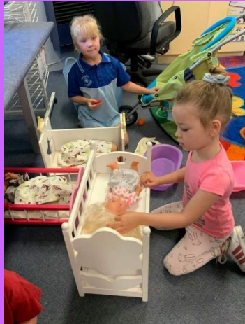
Bella and Ruby bathing and putting the baby dolls to bed.