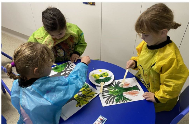
Painting trees after reading 'The Last Tree in the City.'