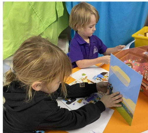
Making Bluey Sticker pictures