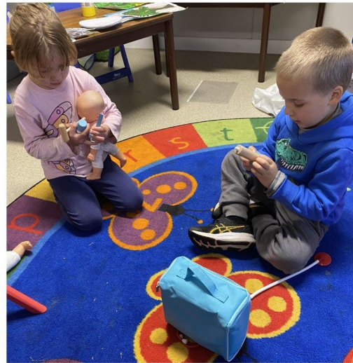
Doctor Role Play