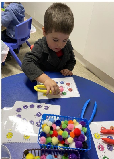
Pom Poms & tweezers