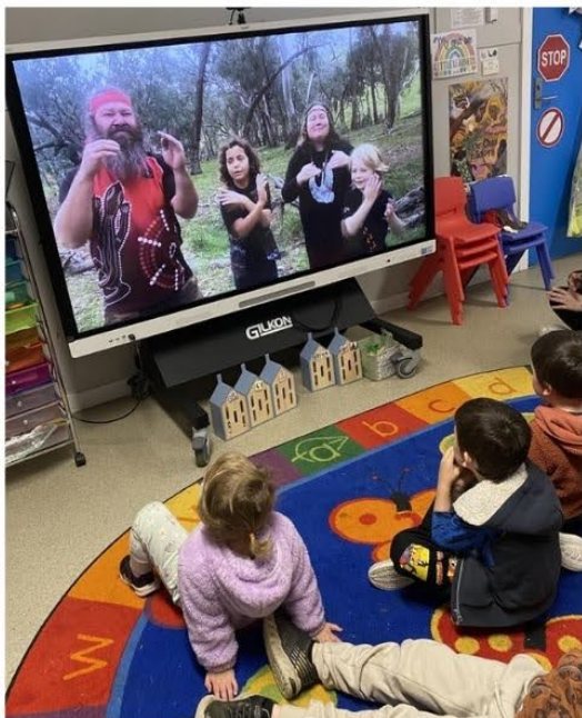
Listening to Twinkle Twinkle Little Star sung in Wiradjuri.