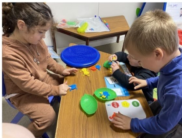
Fine Motor Frog Jumps